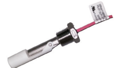
LS-7 Float Reed Switch