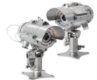
SafEye 900 Series Open Path gas detectors