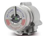
SharpEye 40/40 Series Flame detectors