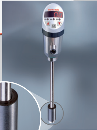
Float / reed system