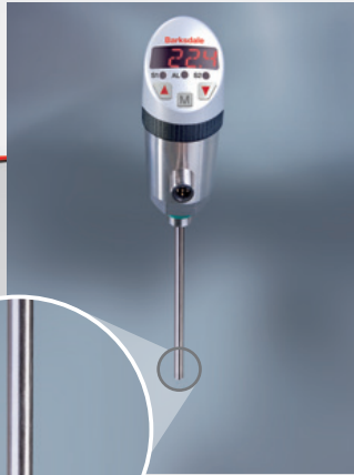
Temperature sensor Pt100