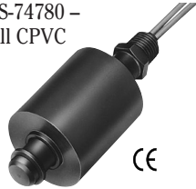
LS-74780 – All CPVC

Particularly well suited for rough service. Ideal for use in chemical and plating applications.