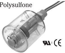
LS-30 Series– Polysulfone

For water-based liquids, with limited use in oils and chemicals. Cost is suited for high volume OEM use. Polysulfone material of construction complies with FDA food contact regulations.